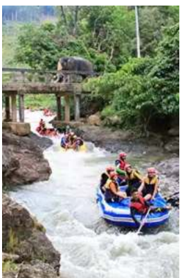
Photo book Rafting Phang Nga : Photo book Rafting in Thailand enjoy eco-tours and outdoor adventure activities such as elephant trekking, bamboo rafting and white water rafting (Amazing Thailand 1) by David Magida(Kindle Edition)

Thailand boasts an extensive network of rivers, providing stunning opportunities for photo rafting adventures. Whether you're a beginner or an experienced rafter, there are rivers suitable for all skill levels. From the gentle rapids of the Mae Taeng River to the adrenaline-pumping rapids of the Pai River, there's something for everyone.