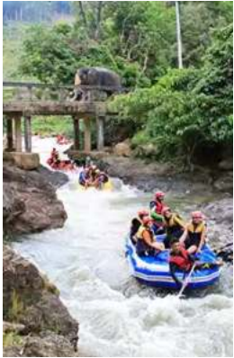
Photo book Rafting Phang Nga : Photo book Rafting in Thailand enjoy eco-tours and outdoor adventure activities such as elephant trekking, bamboo rafting and white water rafting (Amazing Thailand 1) by David Magida(Kindle Edition)

So, grab your camera, embark on a photo rafting adventure in Thailand, and let the thrill of the rapids and the beauty of the scenery inspire your photographic creativity!