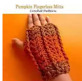
Pumpkin Fingerless Mitts Crochet Pattern

Embrace the creativity and craftsmanship of local artisans by choosing handcrafted gloves that stand out from the crowd. Say goodbye to cold hands and hello to trendy and practical accessories.